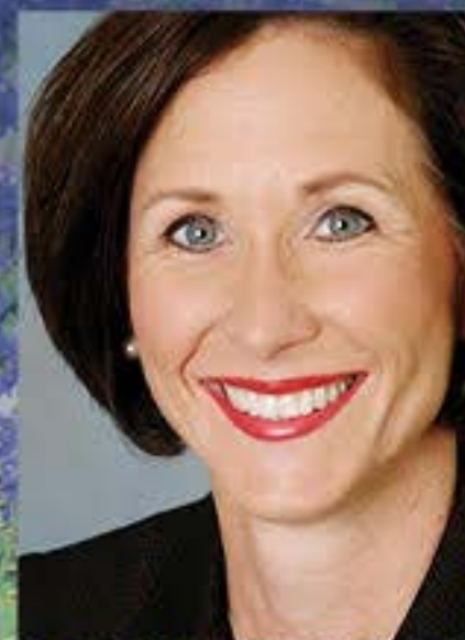
Senator Lois Kohlkorst (sponsor of SB 6) Faith in Action Award