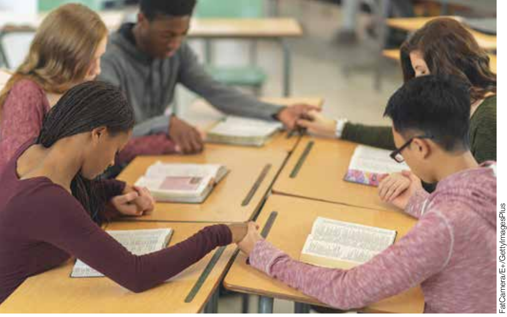
Banned behavior: When the Supreme Court usurped power over schools by banning school-led prayer and Bible reading, a new religion was established.

In April, for instance, the California State Board of Education voted unani-