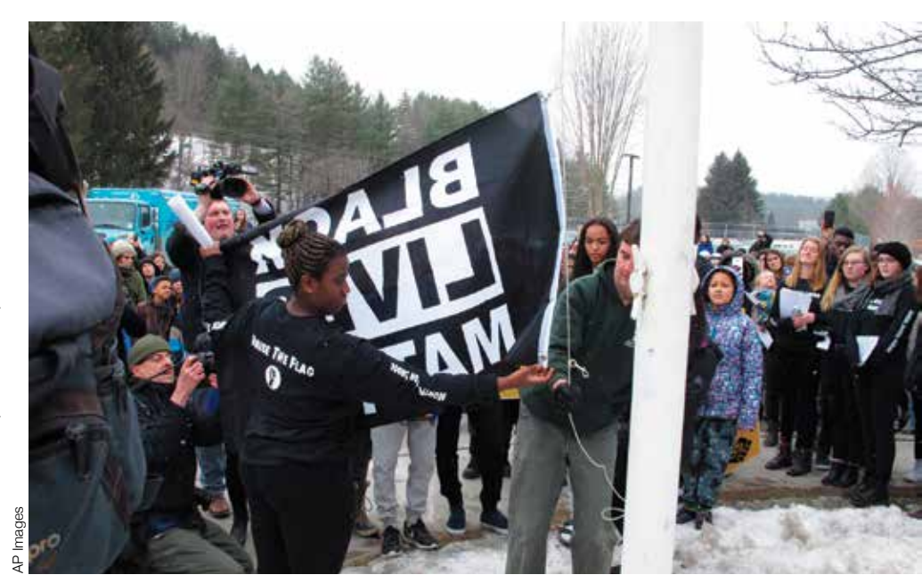
About more than black lives: BLM, founded by ancestor worshipers and self-described Marxists, has invaded virtually every public school in America with anti-Christian extremism.

The obvious answer would be that instead of killing somebody, each capable person could take a turn swimming alongside the raft until rescuers arrive. But naïve children, trapped in the exercise, begin to think — because they are led to do so — that their parents, their pastor, and their Bible must all be wrong. Morality and ethics, they conclude, depend on the situation. This shatters a child's worldview and drives them into moral relativism almost immediately, while discrediting their parents and the Bible forever.