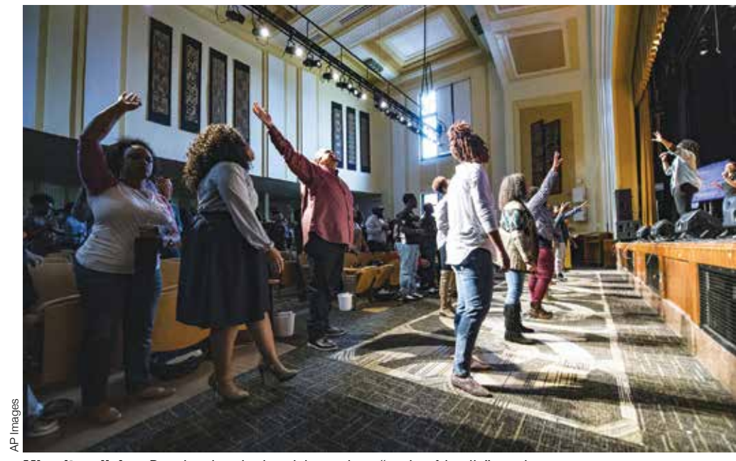
Minority religion: Despite church gimmicks such as "seeker friendly" services to attract young people, millennials are the first generation in U.S. history in which self-described Christians are a minority.

What is taking place in government schools today is a radical departure from the ubiquitous Christian education that reigned in America from the early 1600s until the mid-1800s.